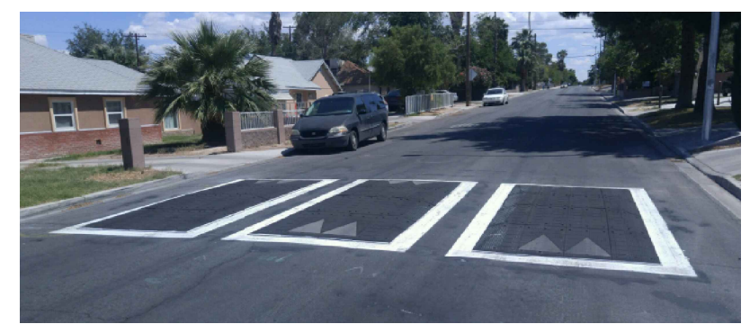
EXAMPLE SPEED CUSHION LAYOUT ON 15TH STREET

DEPARTMENT OF PUBLIC WORKS TRANSPORTATION ENGINEERING